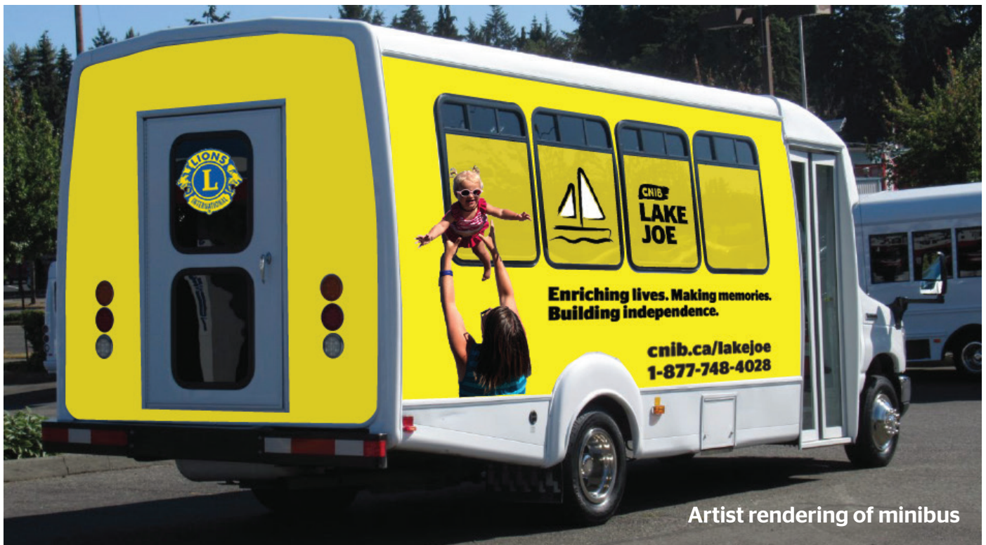
Artist rendering of minibus